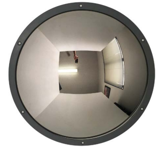
Tamper-proof Frame Optional