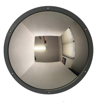
Tamper-proof Frame Optional